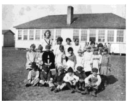
Hawkeye School 1923